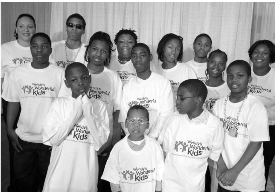
Fashion show participants.