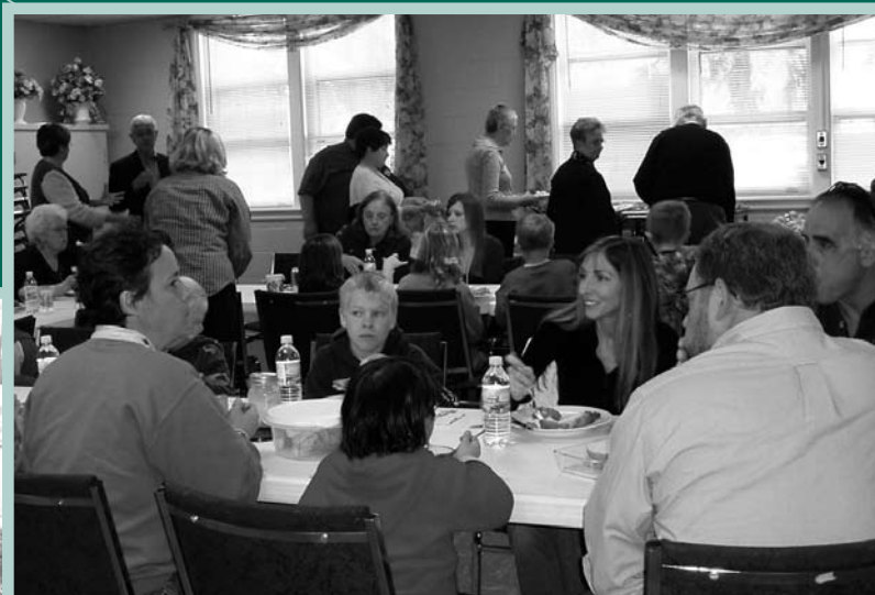
Adoptive families enjoy lunch together.