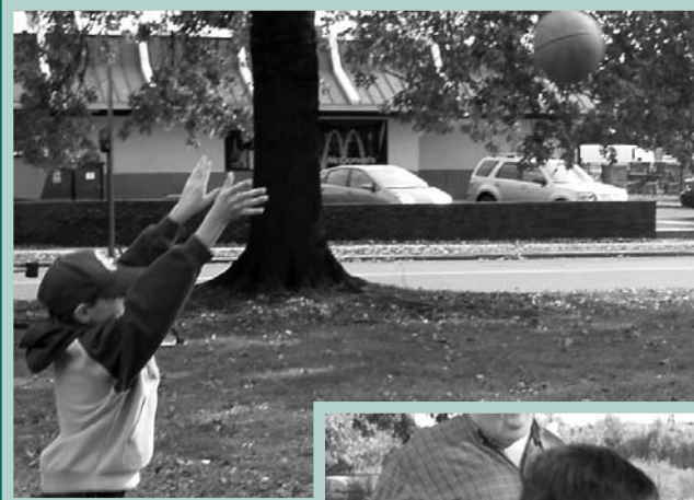
Shooting hoops for prizes.