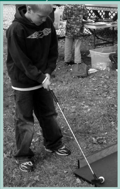
Serious golfer tries for hole in one.