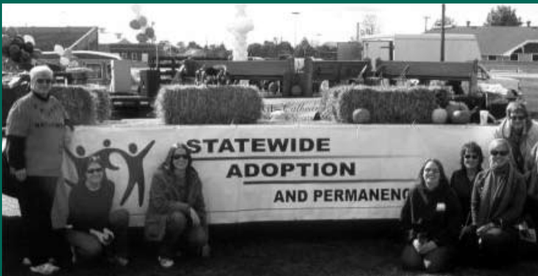
Staff from Diakon Adoption & Foster Care, along with York County Children and Youth, Children's Home of York, and the Statewide Adoption and Permanency Network rode in the 2007 Halloween Parade in York, Pa. Their float was entered by the York Area Adoption Coalition to promote the adoption of children with special needs.