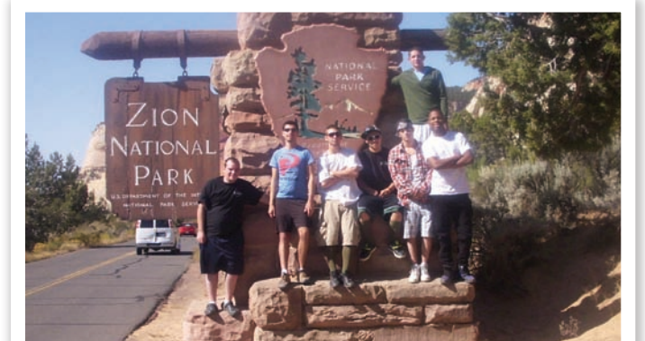
Zion National Park.