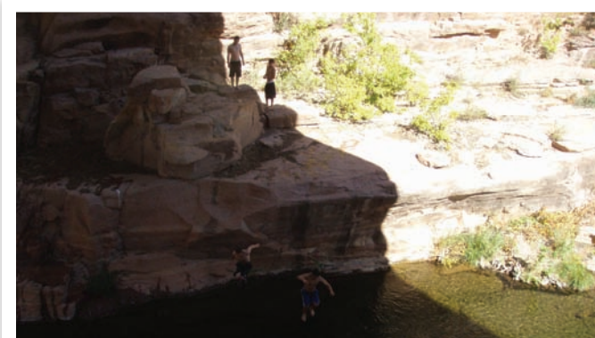
Leap of faith.