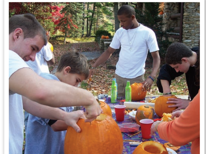
Pumpkin carving at the Lodge.