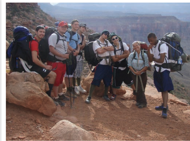
The group at the Canyon rim.

Thanks to your help and support, the Flight Program embarked on an amazing and memorable 9 day trip to Arizona and Utah. This trip offered many new and exciting opportunities for these young men, such as flying in an airplane. We were able to hike, camp, and explore Zion National Park, Lone Rock at Lake Powell, Wupatki National Monument, the Thunder River and Deer Creek trails of the Grand Canyon (one of the most difficult routes into the canyon), Slide Rock State Park, and Sedona. Highlights included camping under the stars each night, swimming in a waterfall at the bottom of the Grand Canyon, and cliff diving. We all pushed ourselves to our physical, mental, and emotional limits at one point or another during the challenging hike to the bottom and back in the Grand Canyon and relied on one another for support, encouragement, and occasionally just a good laugh. With the help of daily journaling, discussions, and yoga, this time away from civilization allowed us to focus on our lives, our future, and simply to grow closer in our positive fraternity with one another. This experience will be a highlight of many of our lives for years to come and was made possible only through our fundraising efforts and your support.