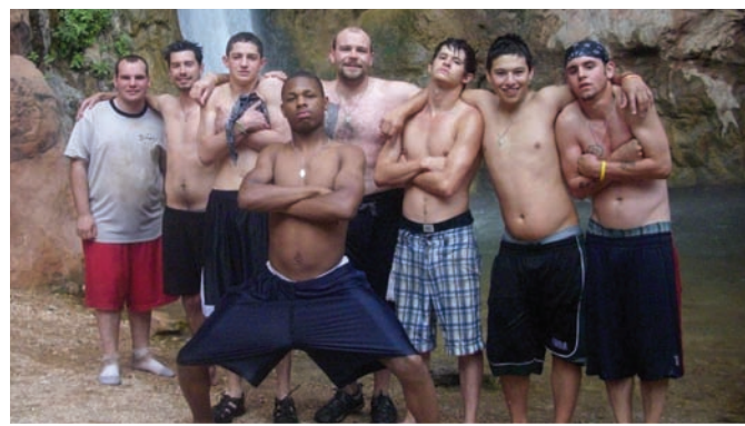
At the waterfall.

Today is the future. Today we are voluntarily participating in the Flight Program and we're taking new and challenging steps in our lives to change and become successful. We rely on one another for support. We attempt to do what is right, not what is easy. We now look towards the future and our goals instead of living "in the moment." We want the best